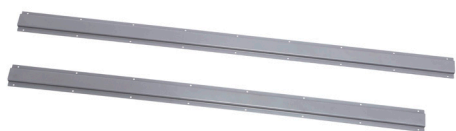
Stiffening rails for 1500 and 1800 tops