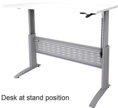
Desk at stand position