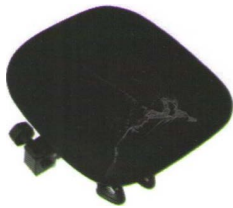
Seat with mechanism