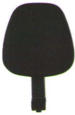
Back with bellow